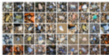
2. ME OLD CHINA £750