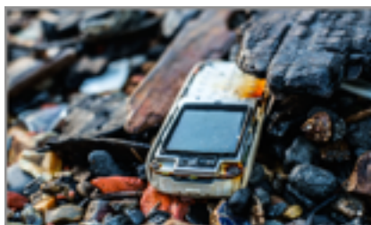
10. WASTED MINUTES £450