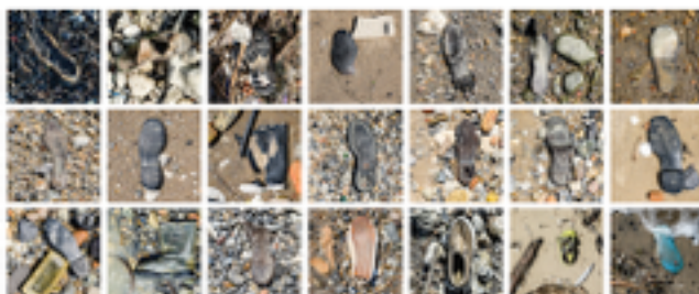
13. SHOE FETISH £350