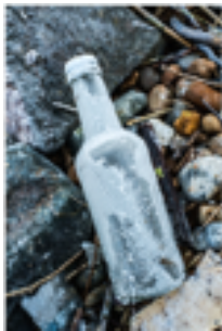
7. BOTTLED IT £350