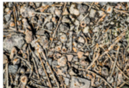
5. ANY OLD IRON £800