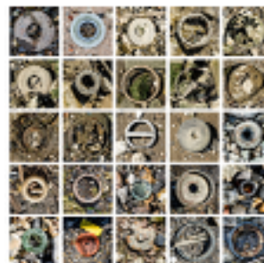
11. CIRCLES IN THE SAND £250