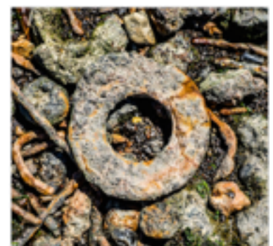
15. WASHER £400