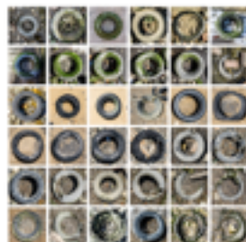
8. TYRED £350