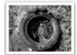
9. TYRE SPLASH £250