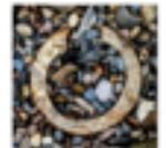
3. ROUNDED VEIWS £350