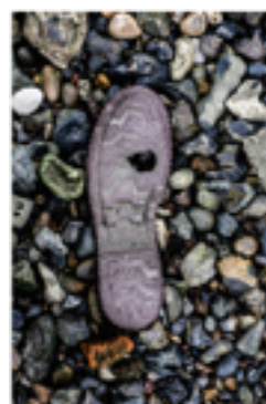
14. HOLE IN MY SHOE £500