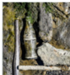
16. OLD BRAND £400