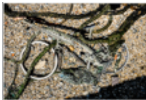
4. ON YOUR BIKE £550